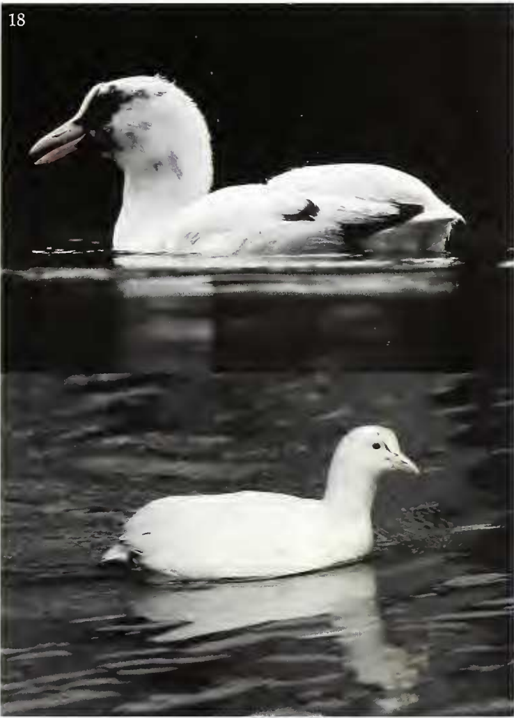
Figure 18. Two Common Coots Fulica atra showing different stages of progressive greying; top: Tolkamer, the Netherlands, 29 June 2006, below (in final stage of progressive Greying): Capelle aan den IJssel, the Netherlands, 28 March 2004